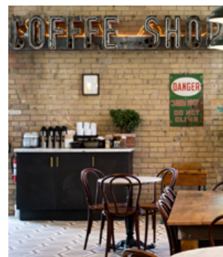
BALZAC'S SIGNATURE FURNISHINGS INCLUDED IN RENTAL

Balzac's Powerhouse Café is available for exclusive use 7 days a week throughout the year. As we operate as a café during the day, the cafe is only available for evening events and will close no earlier than 5pm. Set up may begin at this time and the recommended start time for events is 6:00-6:30 pm. All events must end by 1:00 am not including tear down and clean up.