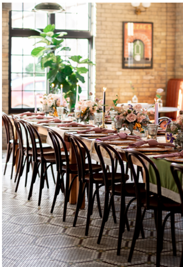
SPACIAL DINING OPTIONS & LAYOUTS