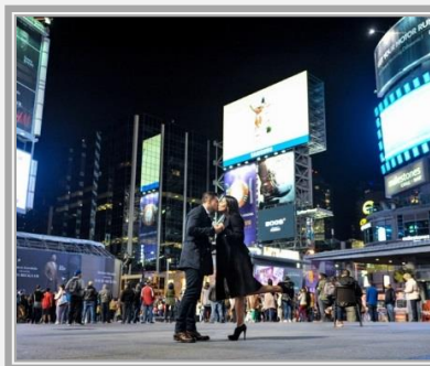
Yonge-Dundas Square- Downtown Toronto

Prices are subject to applicable taxes and 15% Gratuity ♥ London Hall Wedding Packages 2017-2018 ♥