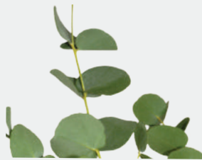
Silver dollar eucalyptus

They won't be in every bouquet, but these are some of the ingredients we'll likely use!