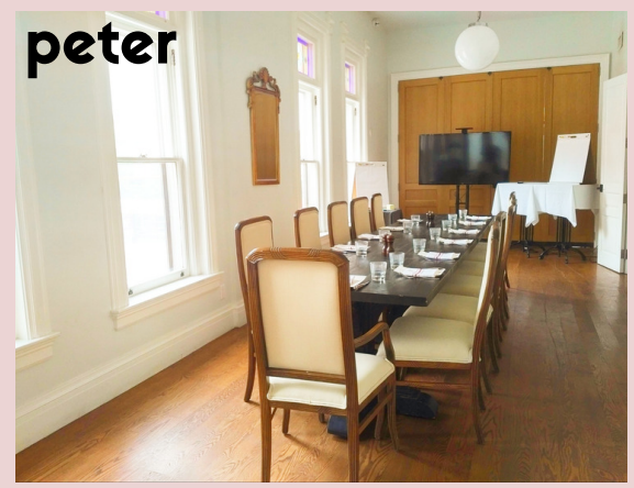
22 Seated, or 40 Standing