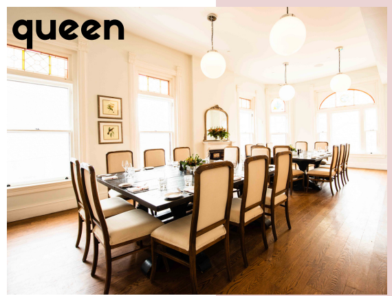
32 Seated or 50 Standing