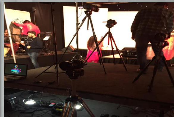
Film & TV Production