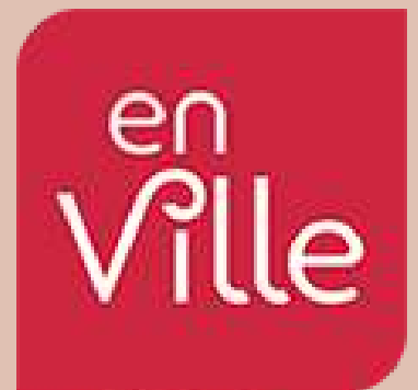
en Ville Catering