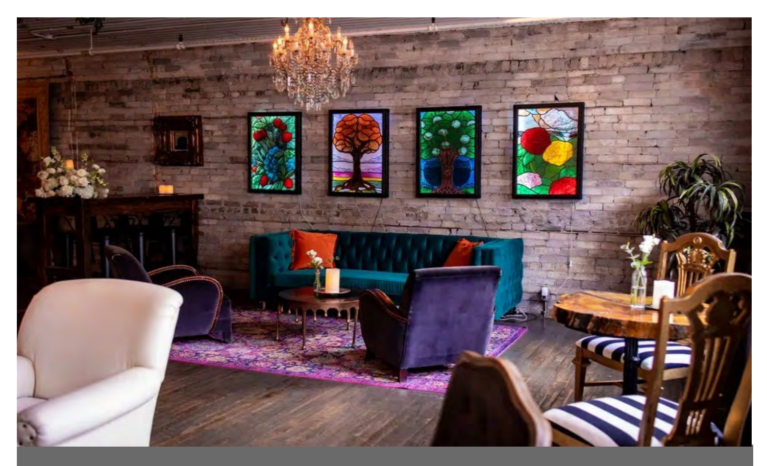
Our Main Floor is 3,000 sq. ft and features exposed brick, crystal chandeliers, stained glass, tapestries, artwork and beautiful furnishings.