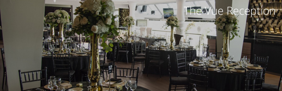
The Vue Reception