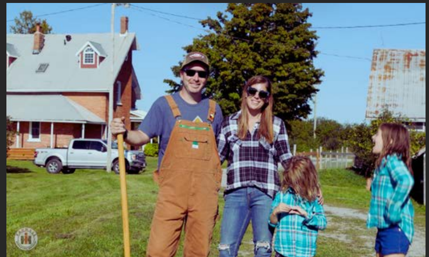
Photo of the exterior pre renovation

We're here to help make your special day as memorable and stress-free as possible. That's why we offer event coordination to ensure that important details are taken care. Let us help with the logistics so you can focus on enjoying your big day.